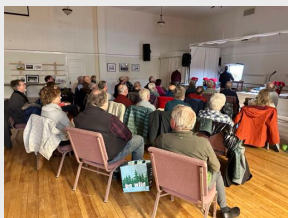
Print Discussion Night

As part of our normal programming, we set aside special times to learn from one another whether it be Print Discussion or Projected Image Competition. Both types of sessions provide great learning moments.