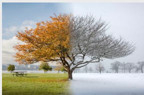
Competition image by Ella Hudson